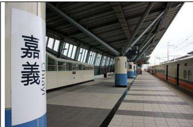
Chiayi High Speed Rail Station