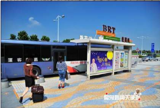
Shuttle bus station (about 20 minutes a bus)