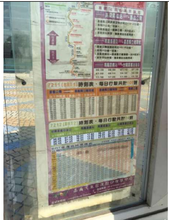
Shuttle bus Schedule

Holding a high-speed rail ticket will be free of charge for the ride. (This ride is about 30 minutes) Get off at Station : Chiayi Transit Station 嘉義轉運站 (AKA. rear station of Chiayi train Station).