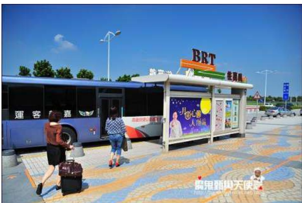
Shuttle bus station (about 20 minutes a bus)