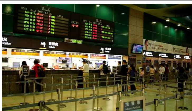
Ticket Counter of Kaohsiung High Speed Rail Station (Destination: Chiayi High Speed Rail Station)