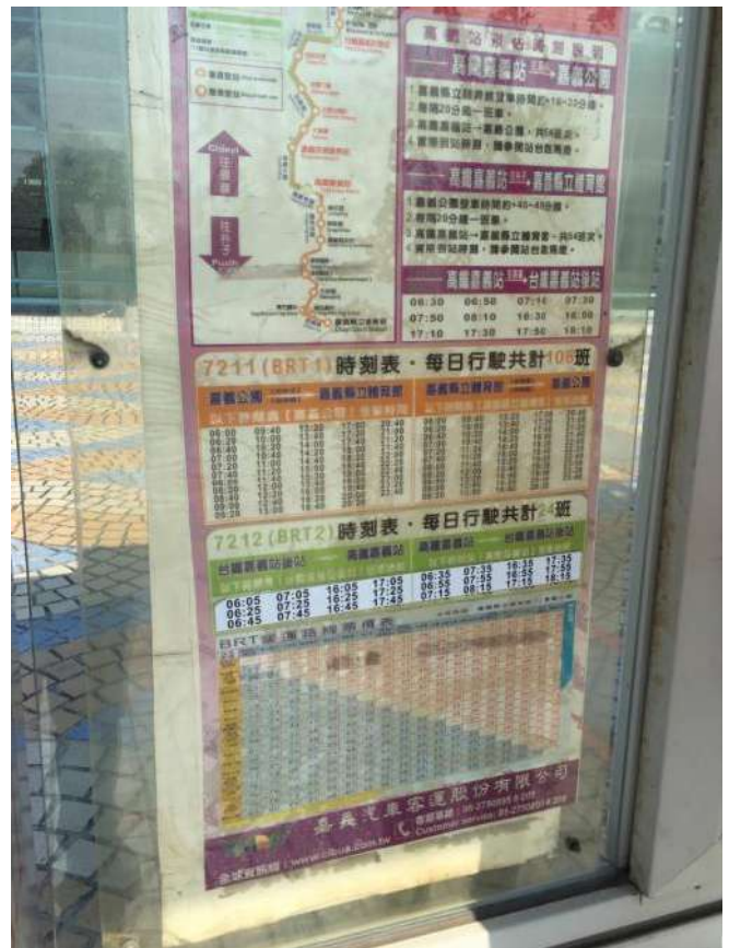
Shuttle bus Schedule

Holding a high-speed rail ticket will be free of charge for the ride. (This ride is about 30 minutes)