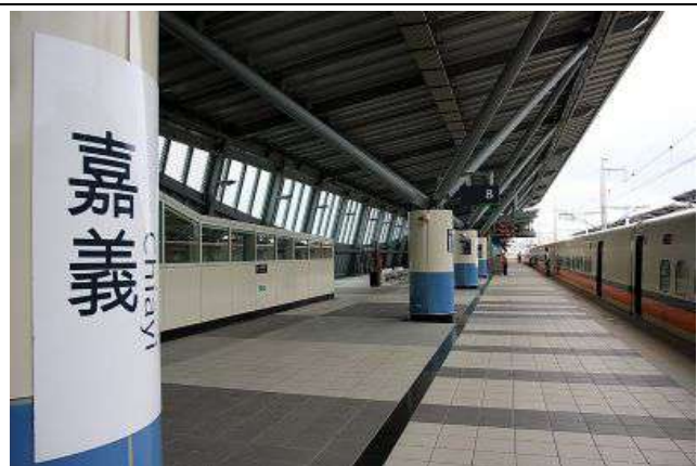
Chiayi High Speed Rail Station

Kaohsiung to Chiayi about half an hour / trips inquiries ( http://www.thsrc.com.tw/tw/TimeTable/SearchResult )