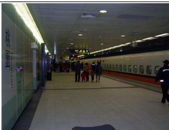
Go to the platform 10 minutes before the time of departure

Kaohsiung to Chiayi about half an hour / trips inquiries ( http://www.thsrc.com.tw/tw/TimeTable/SearchResult )