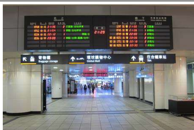
Lobby of Kaohsiung High Speed Rail Station