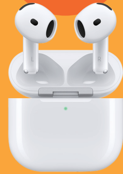
AirPods 4 1 winner