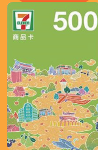
7-11 NTD$500 gift voucher The first 100 respondents to complete the survey