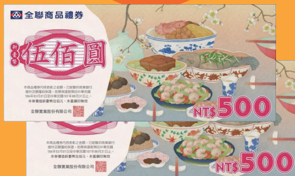
Px Mart NTD$1,000 gift voucher 10 winners